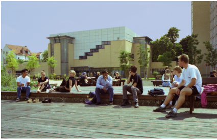
Squad and Cafeteria