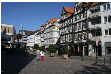
Hannover Old Town

Hannover is a lively city with a 24/7 public transportation system.