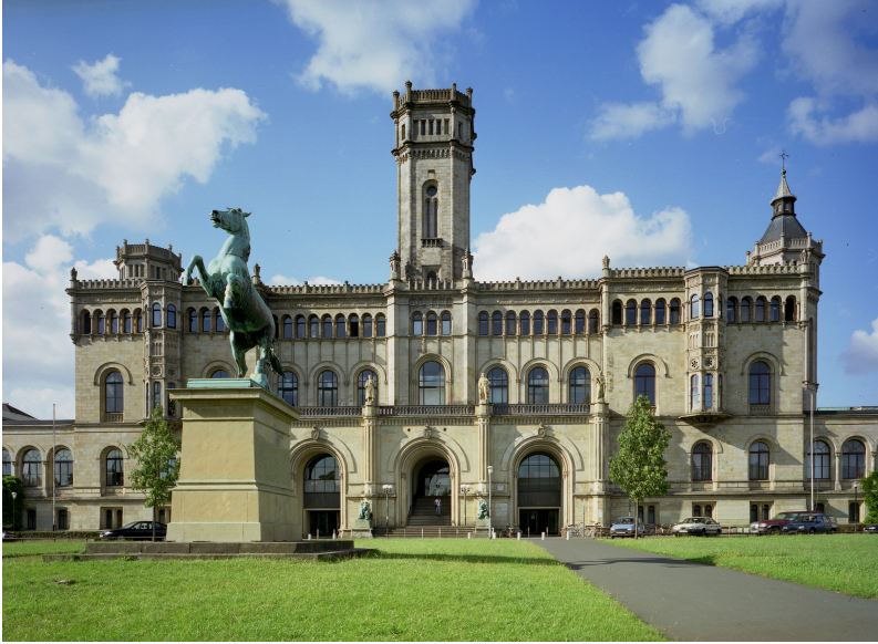
Leibniz University of Hannover, Main Building