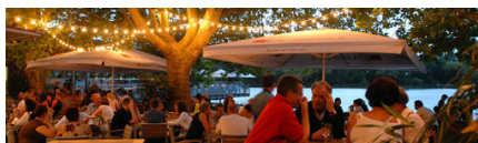
Beer Garden in Hannover

During the summer months people in Hannover enjoy relaxing in one of the many outdoor cafe's or have a drink and a sausage in one of the beer gardens. Hannover has many museums , theaters and quite a few clubs.